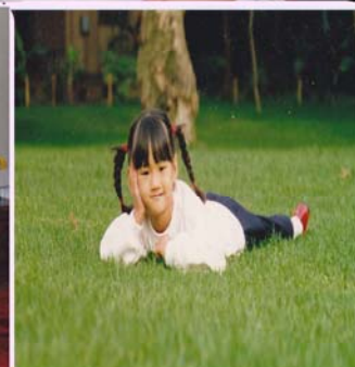
With Family Members