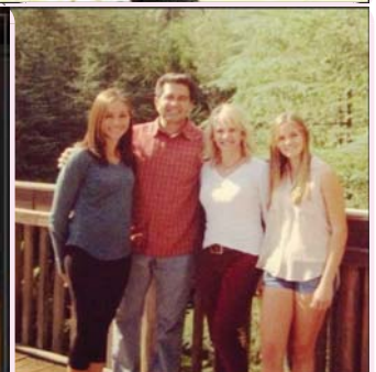
With Family Members