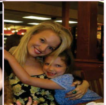
With Family Members